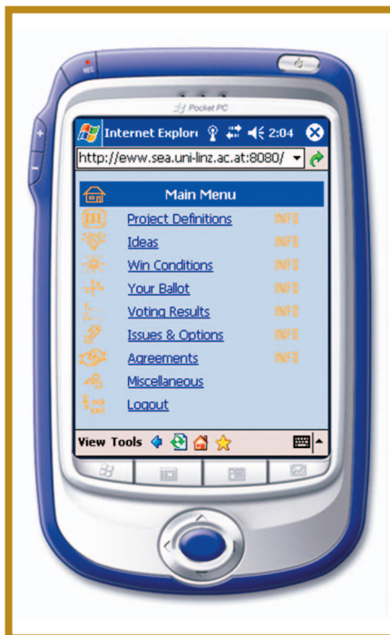
Figure 2. The ARENA-M tool.

ment system, your mobile device is the key to accessing requirements whenever and wherever you want. Access to requirements repositories means you